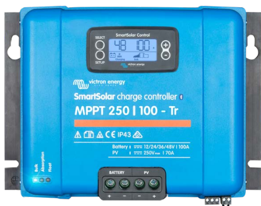
Solar Charge Controller MPPT 250/100-Tr with pluggable display