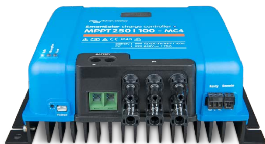
Solar Charge Controller MPPT 250/100-MC4 without display