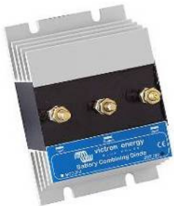
Argo Diode Battery Combiner BCD 702

Diode battery combiners are used to guarantee continuous DC power to mission critical equipment, such as an electronic engine control system. With a diode battery combiner two or more DC power sources can be used in parallel to supply the mission critical load. Failure of one source will not interrupt power to the critical load.