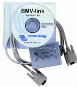
Optional isolated RS232 communication interface and VEBat software (for BMV 602 and 602H)